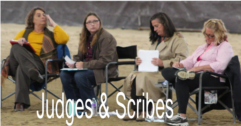
Judges & Scribes